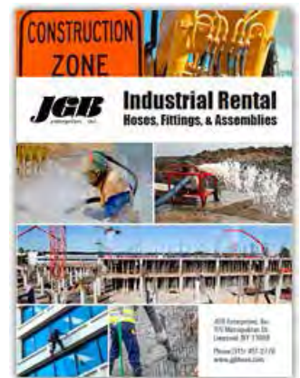
Industrial Rental Catalog