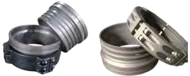
Two Styles of Field Ends