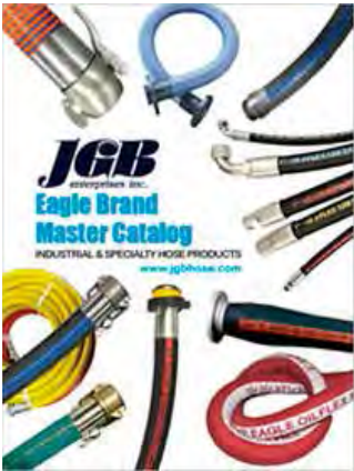
JGB Eagle Brand Catalog

For market specific catalogs visit www.jgbhose.com/hose-assemblies-fittings-by-market .