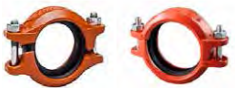
Standard Rigid Coupling as well as QuickVic available.